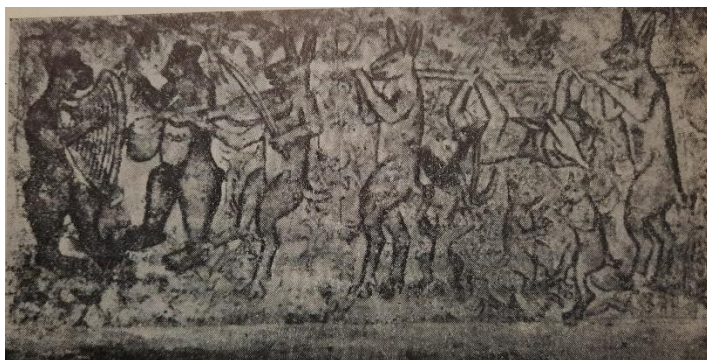
Fig. 2 Fresco of the city of Zvolen 1

At the end of the middle age era the references about folk music were beginning to slowly appear in the historical sources. Slovak folk music „...is based on eastern European elements but contains many features of west European origin, especially in the newer style. Slovak folk music has served as a bridge between the folk music of the two areas by introducing styles and elements of west European melodies and harmonic and tonal principles to Hungary, the Ukraine and other areas.’’ 2 Most of the folk songs were not preserved in a written form, being passed on only through oral tradition.